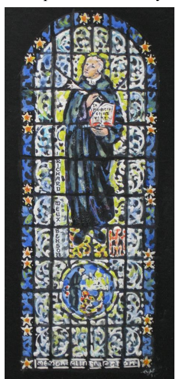
Gouache study for Fr. Benson clerestory window in Chapel of St Mary and St John, SSJE.

in the sixteen clerestory windows was agreed upon. <sup>18</sup> Connick indicated the following in his notes: "Chapel interior is very cool…rather large scale—granite—with a very generous use of warm mortar.