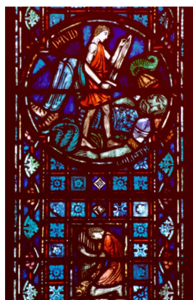
David and Goliath Detail from the David window Nazareth Hall, Northwestern College St. Paul, Minnesota

The 2007 Orin E. Skinner Annual Lecture will be held on Monday November 5th at 6:30 pm at Moseley Hall, Church of the Advent, 30 Brimmer Street, Boston. *