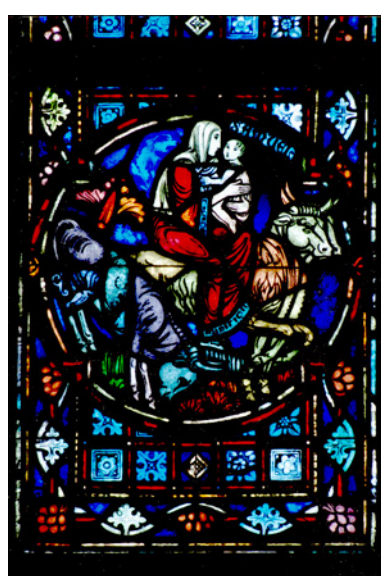
Detail from the Samuel window Nazareth Hall, Northwestern College St. Paul, Minnesota

I will never forget our friends at The Catholic Archdiocese of St. Paul and Minneapolis, the thousands of "boys" who were educated in halls of Nazareth and the priests who taught at the Seminary and continue to serve the Catholic community or reside at Leo Byrne Residence at St. Paul Seminary.