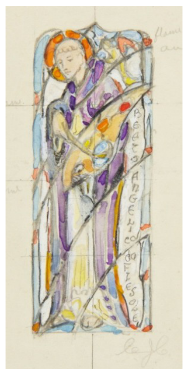
Charles J. Connick watercolor design Beato Angelico da Fiesole Princeton University Narthex window